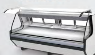
MCRU 100 WL