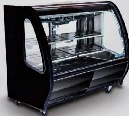
DDC 60 B