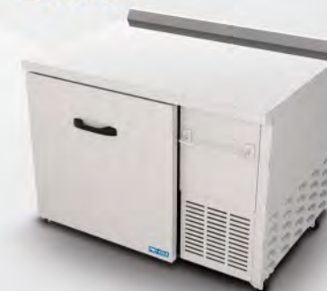
UCT 44 01