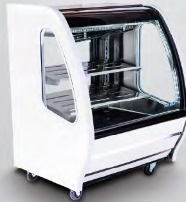
DDC 40 W