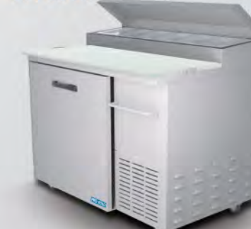
PPT 44 01