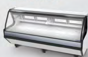
MCRU 100 W