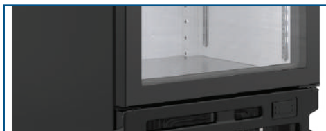
Stainless steel floor