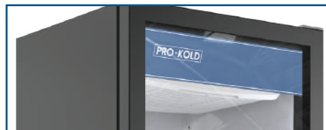
Space for advertising