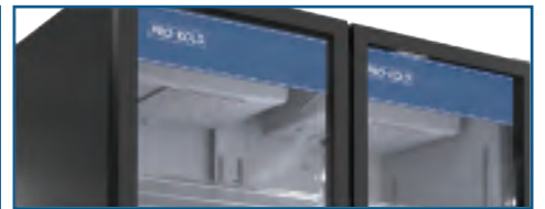
Space for advertising