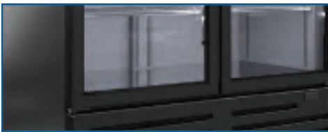
Stainless steel floor