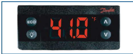
Electronic digital controller