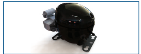
Easy access to compressor