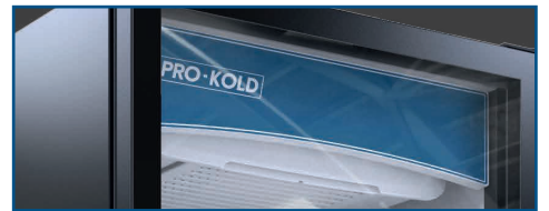
Space for advertising