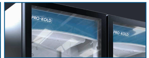
Space for advertising