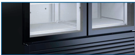
Stainless steel floor