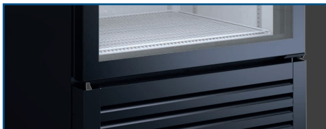
Stainless steel floor