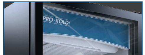
Space for advertising