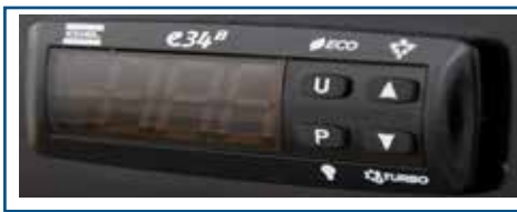
Electronic Digital Controller