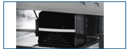
Easy Access to Compressor