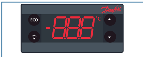
Electronic digital controller