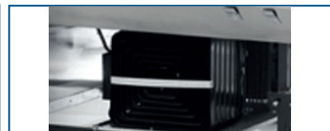
Easy access to condensing unit