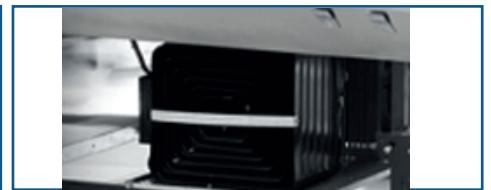
Easy access to condensing unit