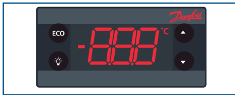
Electronic digital controller