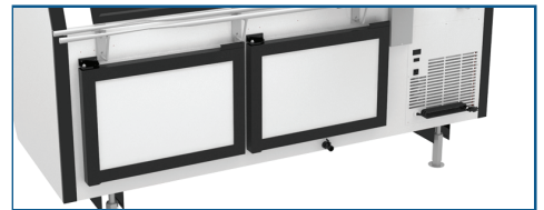
Rear, undercounter storage