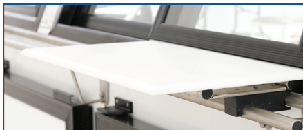
Sliding, rear work table