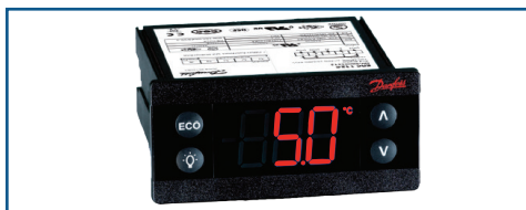
Digital Temperature Controller