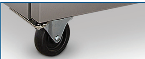
Heavy Duty Casters