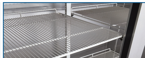
Electrostatically painted Shelves