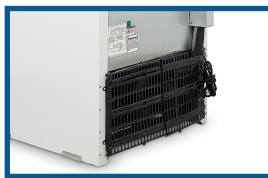
Easy access to condensing unit