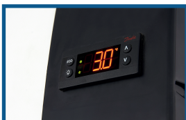
Electronic digital controller