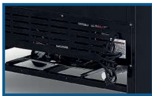
Easy access to compressor