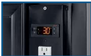
Electronic digital controller