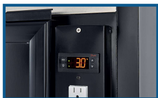
Electronic digital controller