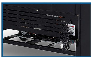
Easy access to compressor