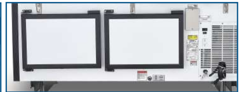
Rear, undercounter storage